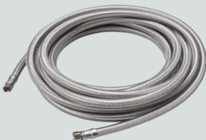
Ice Maker Supply