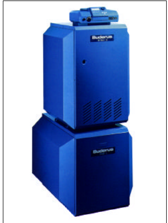
G124X Series Boiler