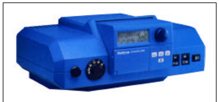
HS2102 Ecomatic Control