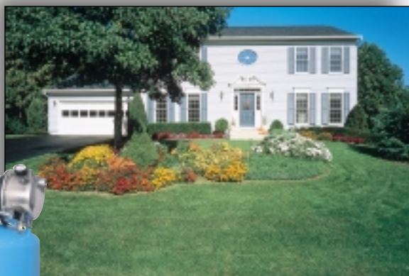
Homes located at higher elevation levels have terrific views but often experience low water pressure. The High Performance Pressuriser can fix that.