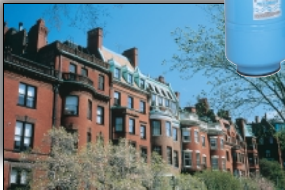
Elevation robs pressure - In this 5-story apartment house, an AMTROL RP-HP Pressuriser could give everyone the pressure they want or need.