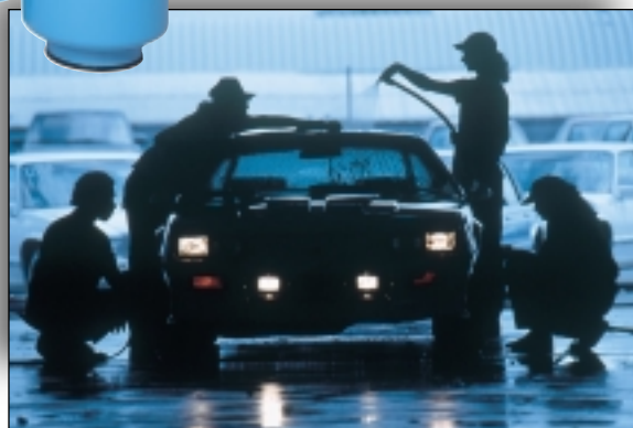
Automatic carwash facilities require high water pressure to meet the demands of hundreds of customers daily.