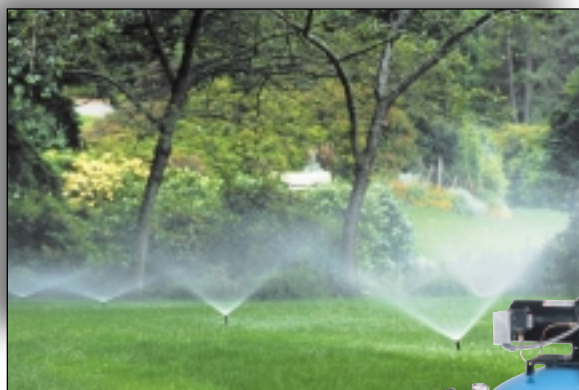
Inground sprinkler system requires high water pressure to function properly.

The HP Series is designed with the homeowner and property manager in mind. It is made in the USA and covered by a 2-year warranty. Make living with inadequate water pressure a distant memory. Call your professional AMTROL installer today.