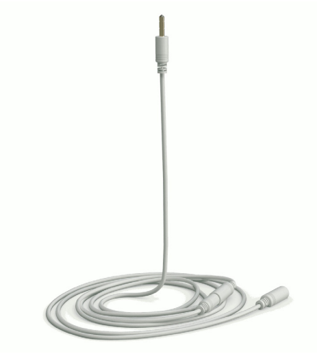
Flo by Moen<sup>™</sup> Smart Water Detector 6' Leak Sensing Cable